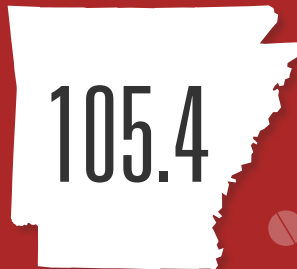
prescriptions per 100 people